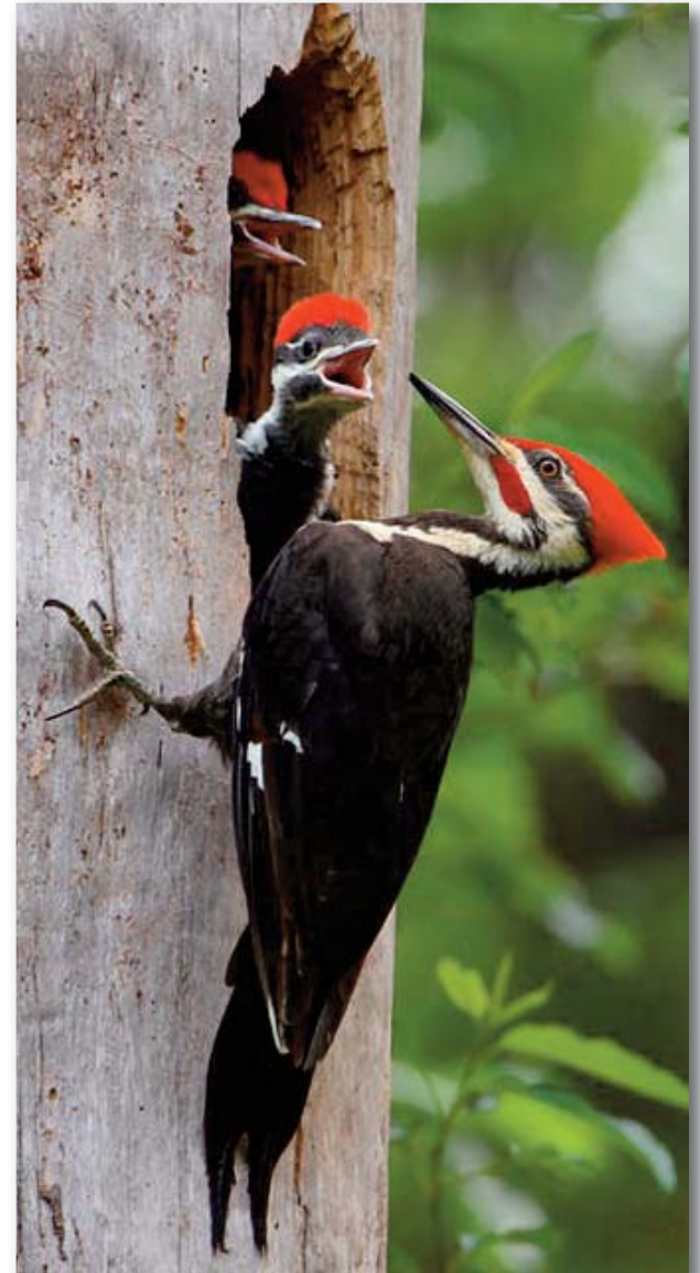
Pileated Woodpecker

EMAIL SIGN-UP. Send email to: membership@laudubon.org . Provide •name(s), •email addresses, & •cell phone #s and wait for email confirmation. 🐦