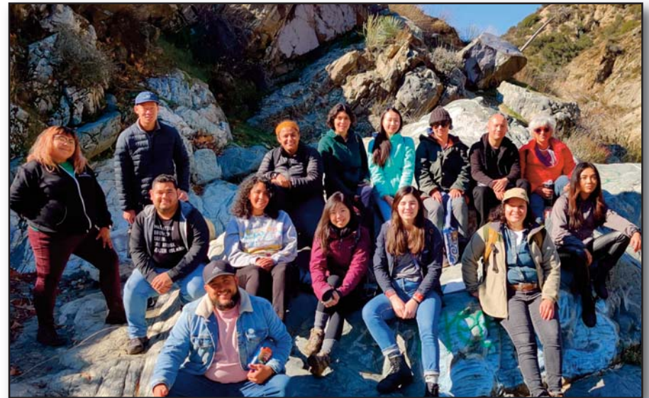
Members of Nature for All Leadership Academy–Cohort 17 at the San Gabriel National Monument.

On our very first day of the Leadership Academy, I recognized a few people in our cohort that I've met through Los Angeles Audubon programs. This made me reflect on how small the nature leader community is in the Los Angeles area, especially leaders who are Black, Indigenous, People of Color (BIPOC). I am excited to learn and share knowledge with people who have a passion for nature and for community advocacy in our highly urbanized habitat.