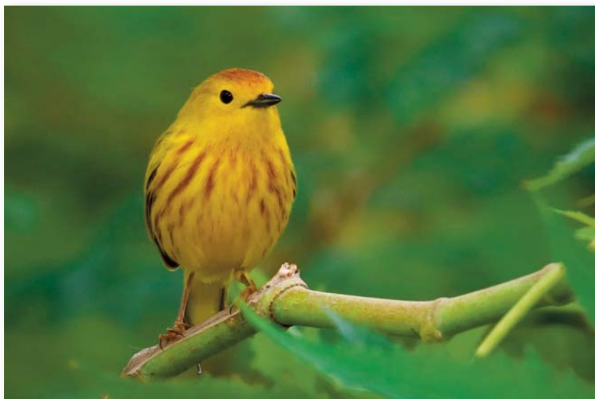
Golden (Yellow) Warbler

We picked Sainte-François as our hub for Grande-Terre, visiting the ports and beaches for our first sightings of seabirds such as Royal Terns and the Magnificent Frigatebirds. Continuing to the easternmost point of Grande-Terre, we discovered one of the most incredible landscapes in Guadeloupe – Pointe des Châteaux, overlooking the turbulent Atlantic Ocean. Climbing the rock staircase to the top of the point, we stood beneath the enormous 33-foot-tall cross of Pointe des Châteaux, which commands a 360-degree view of nearby islands and sculpted cliffs. While the views alone were breathtaking, as we hiked back down through the scrubby brush and trees to the parking lot, we saw a flash of yellow. A quick look through the binoculars confirmed my hope: we had spotted the Paruline jaune, or Golden (Yellow) Warbler. Though fairly widespread in the area, this was one of my most sought-after birds. We tracked several in the low trees at nearby beaches.