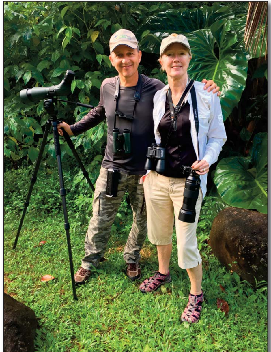
Photo courtesy of Randy Freeman, the writer's fellow adventurer and an avid birder himself.

*The West Indies are comprised of the Greater Antilles, Lesser Antilles and Lucayan archipelago which make up much of the Caribbean Islands.