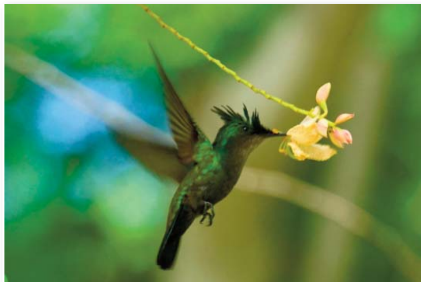
Antillean Crested Hummingbird