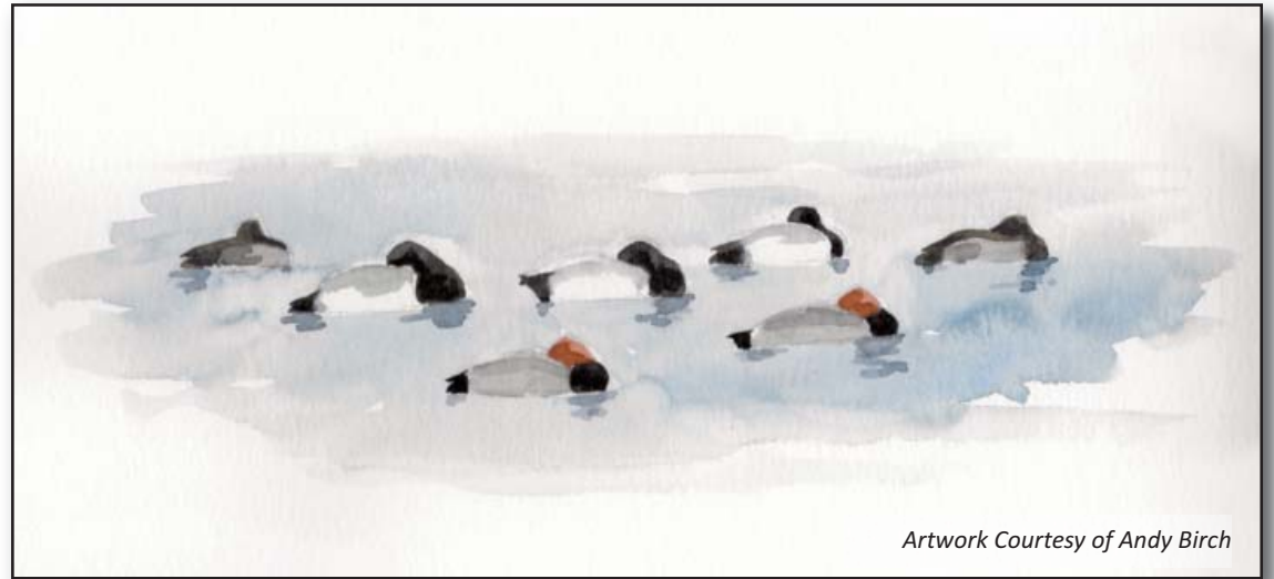
Artwork Courtesy of Andy Birch

LA Audubon's statement regarding the reservoir is that the two most important features as a habitat for birds are the presence of water in the reservoir and the presence and maintenance of a fence that limits disturbance within the water: The presence and maintenance of the fence, keeping people away from the water and water's edge, maximizes the value of the site as a wildlife refuge. Humans and pets disturb birds, such that birds can abandon a site, and the fence is the single most important conservation management tool at the site after the presence of water.