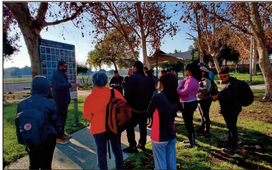
Members of the Nature for All Leadership Academy–Cohort 17 visit Rio Vista Veteran's Memorial Park in El Monte.