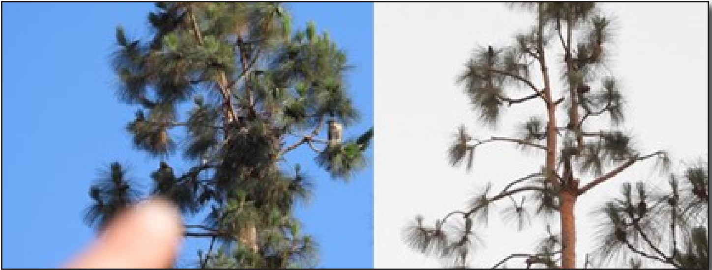
Pine tree with Red-tailed Hawk nest and hawks before and after trimming with distressed hawk perched at the tree.

pair for life and will nest in the same territory year after year, and often in the same nest location. One neighbor fondly called his neighborhood Cooper’s Hawk Anderson, for Anderson Cooper. Study staff have heard all sorts of interesting stories from residents, from hawks bathing in pools and fountains and accidentally flying inside the house, to young Cooper’s hawk plucking a towel or playing with a pine cone as they practice hunting.