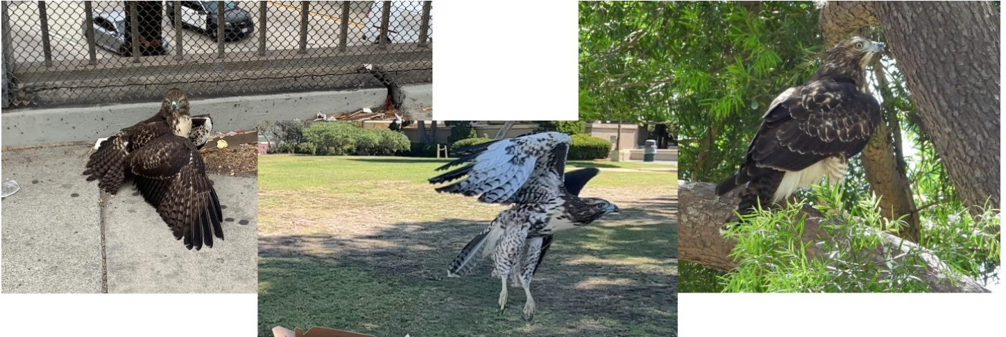
Red-tailed Hawk rescued from freeway overpass and released after rehabilitation.