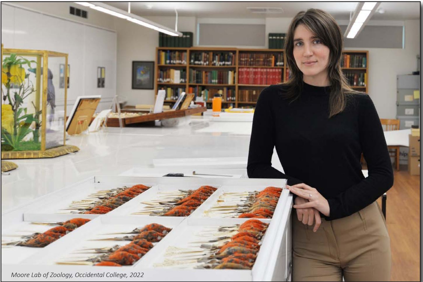
Moore Lab of Zoology, Occidental College, 2022

M y alarm rings loudly as I open my eyes in a panic, feeling for my phone in a pitch black room. I fumble a few times before I find it and then I quickly shut off the ear-splitting sound. The phone lights up: 4:30AM. I close my eyes for a few moments and think, “Maybe I should just go back to sleep.” Until another thought interrupts that one, “But then I will miss the birds!”