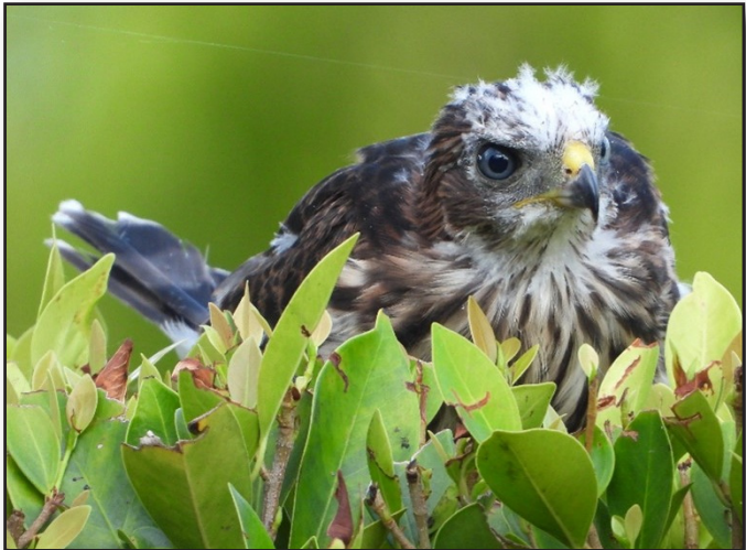
Fledgling Cooper’s Hawk in a front yard in the San Fernando Valley after leaving the nest.