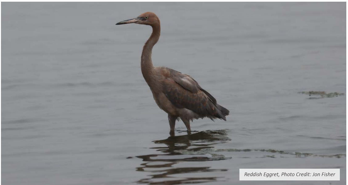
Reddish Egret