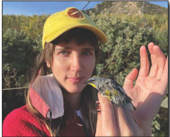
Banding a Yellow-rumped Warbler at Bear Divide, San Gabriel Mountains, 2021

some classes at a community college, became a certified California Naturalist, and eventually decided to actually pursue an undergraduate degree in Biology. In between, I also volunteered at different Audubon chapters, attending events, leading native plant walks, doing point counts along the L.A. River, and Least Tern nest monitoring. Now, at age 30, I'm three classes away from finishing my undergrad at Occidental College, and I get up before the sun, where I drive to a narrow mountain pass in the San Gabriel Mountains and collect data while watching the spectacular dawn bird migration.