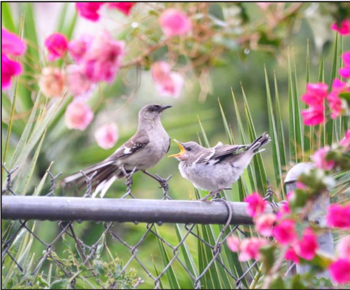
Northern Mockingbirds, my backyard, 2016

some classes at a community college, became a certified California Naturalist, and eventually decided to actually pursue an undergraduate degree in Biology. In between, I also volunteered at different Audubon chapters, attending events, leading native plant walks, doing point counts along the L.A. River, and Least Tern nest monitoring. Now, at age 30, I'm three classes away from finishing my undergrad at Occidental College, and I get up before the sun, where I drive to a narrow mountain pass in the San Gabriel Mountains and collect data while watching the spectacular dawn bird migration.