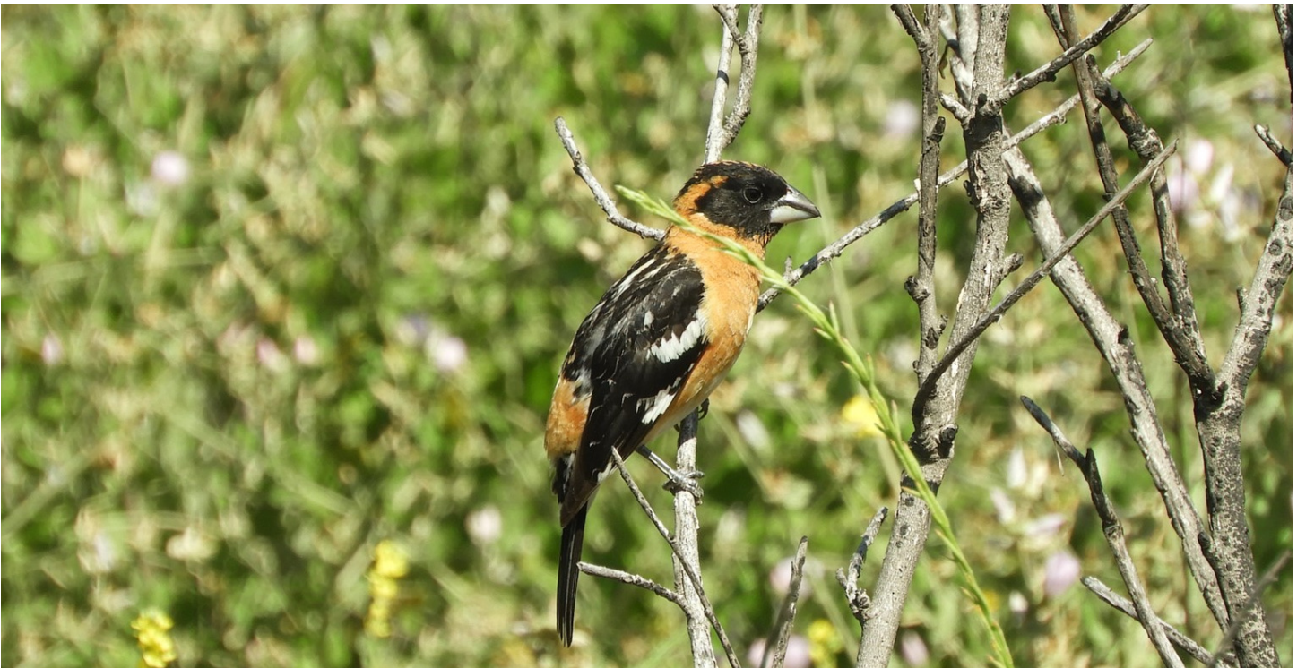
Black-headed Grosbeak, Hansen Dam, 2020