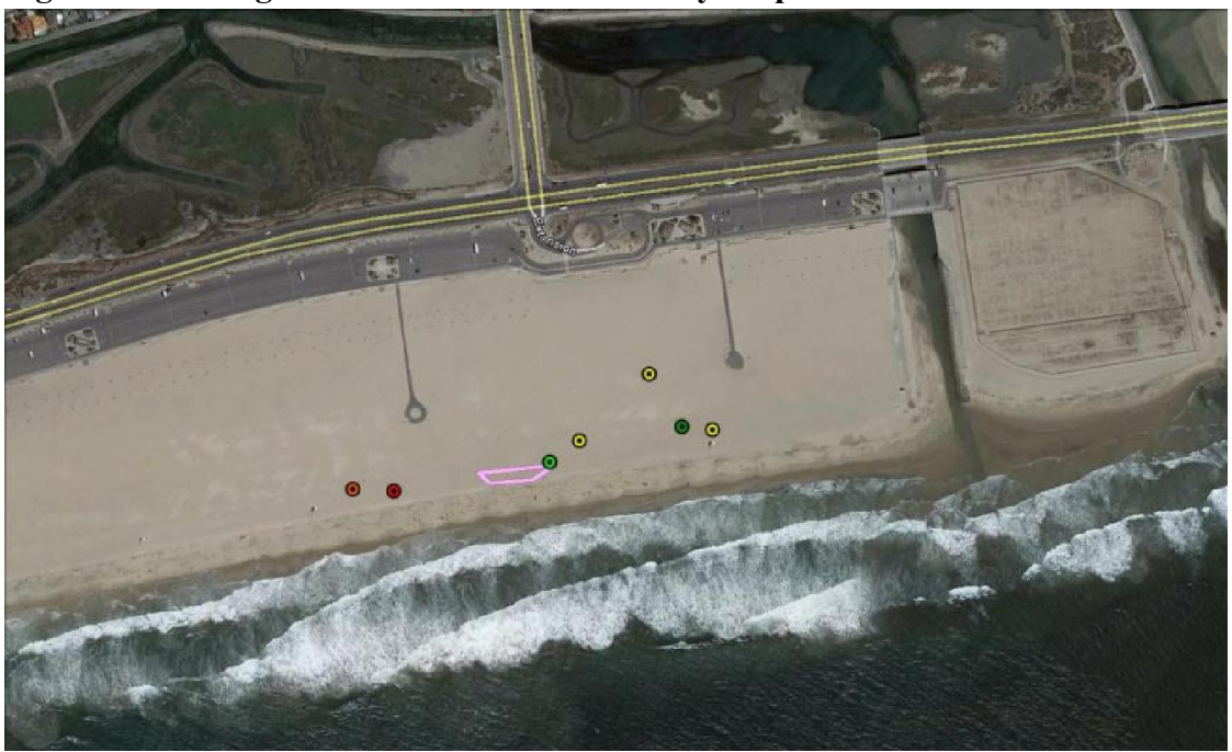
Figure 10. Balboa Beach Roost Survey Map.