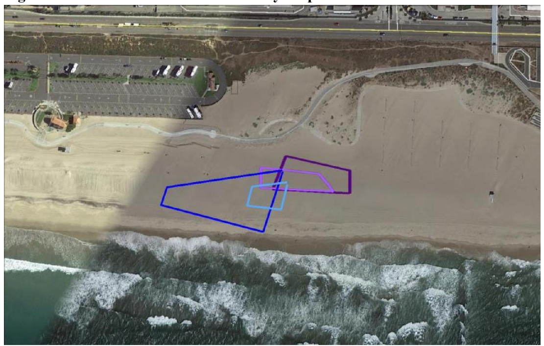
Figure 6. Hermosa Beach Roost Survey Map.