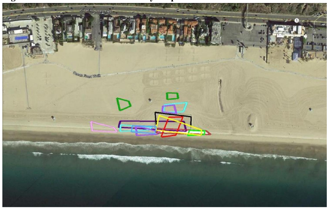
Figure 4. Dockweiler LT 47 Roost Survey Map.