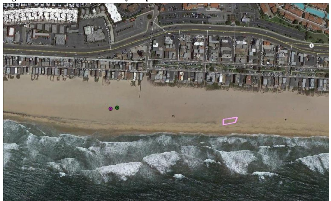
Figure 8. Bolsa Chica State Beach Roost Survey Map.