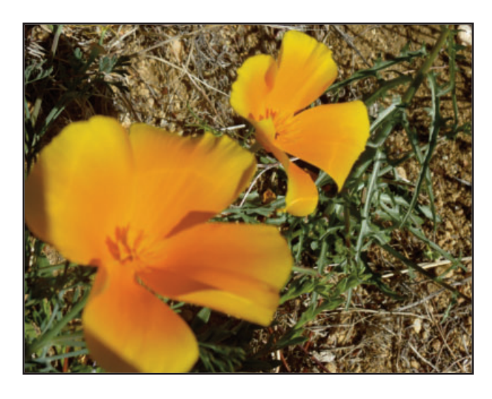
Poppies at Tejon Ranch

The ethereal sounds and brilliant color of Western Bluebirds were entertaining. There was the darting around of Anna's Hummingbirds, and raucous Acorn Woodpeckers with the Northern