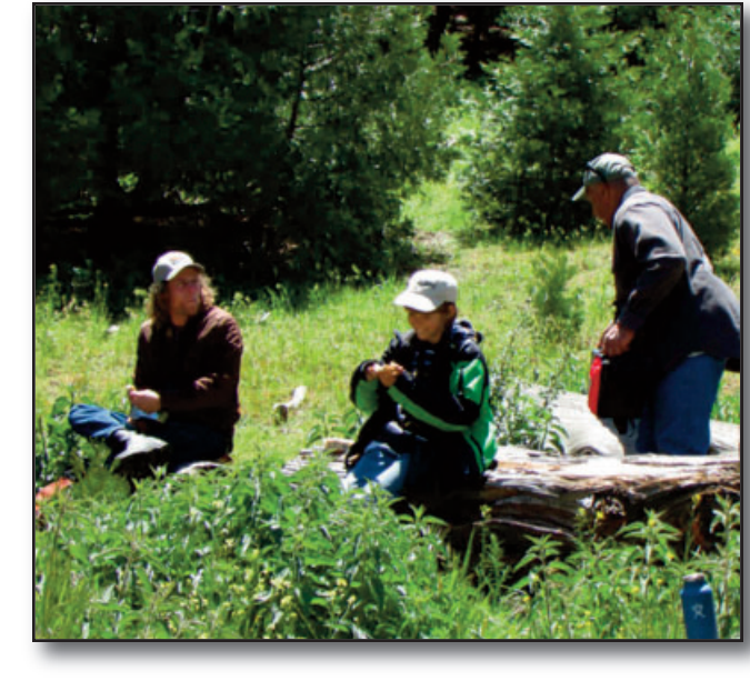
Tejon Ranch 2014, Group Break