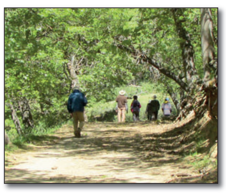
Tejon Ranch Road

However, a sort of grand finale was done all around us. We had more sightings of condors, soaring around. This time there were six in the flock. All in all, we had seven separate condor sightings that day. And, as to not be completely ignored, a male Lazuli Bunting was singing quite loudly at the top of a conifer. Now, if his song weren't beautiful enough, the sun hit this bird like a spotlight and the bird was on stage, so that the blue on the back and throat and the cinnamon/mustard colored breast, and the white belly and wing bars bounced off this bird