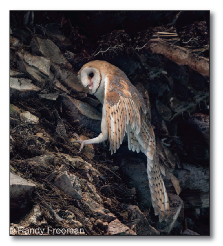
Rather than flying up into the crown of the palm tree, the owl actually scampered up the side of the tree to disappear into the fronds. | Photo courtesy of Randy Freeman.