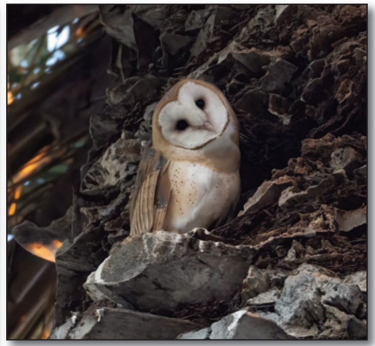
Though her head tilt makes her seem curious about us, more than likely she's just trying to get a better look. Owls have fixed eye sockets, so they must move their heads to see their surroundings. Owls can turn their necks 135 degrees in either direction, for a 270-degree total range of vision.