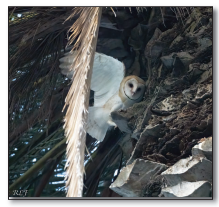
Barn Owls are 12 to 16 inches in length and typically weigh between one and 1.5 pounds, with a wingspan of 3 to 5 feet. They can lift prey up to about 5 pounds. The white beneath the wings adds to their appearance as a ghostly apparition flying through the night skies.

Not only do we get to see these regal spirits soaring through the skies but we get to reap other benefits. Barn owls raising a brood have been reported to catch up to 70 pounds of rodents during the breeding and feeding season. Talk about an abbondanza!